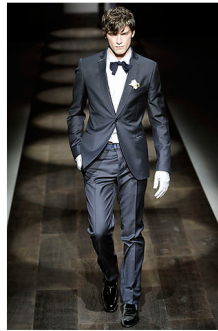
Salvatore Ferragamo 01.jpg