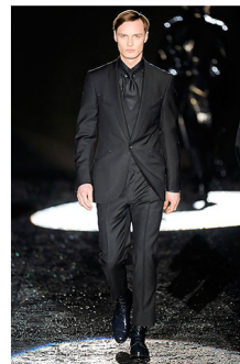
Z Zegna 06.jpg