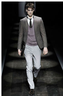
Salvatore Ferragamo 04.jpg