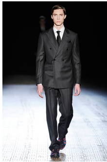
Raf Simons 01.jpg