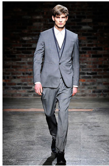
Rag & Bone 01.jpg