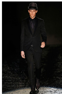
Z Zegna 05.jpg