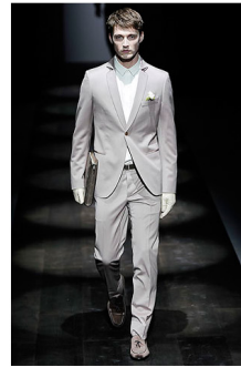
Salvatore Ferragamo 02.jpg