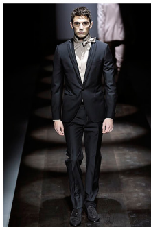
Salvatore Ferragamo 03.jpg